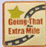
K. Item # PA00074