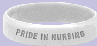
P. Item # PG00049