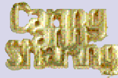
F. Item # PA00024