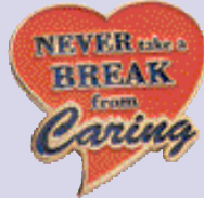
E. Item # PA00011