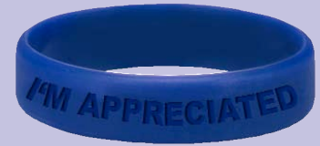
Q. Item # PG00027