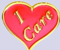
H. Item # PA00039