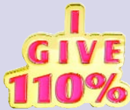
G. Item # PA00036

Choose from our exclusive selection of jewelry-quality pins. Recipients will wear them with pride. Add a special touch to your presentation by handing out in choice of velvet-style gift pouches.