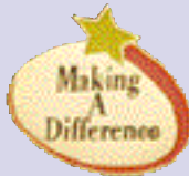
J. Item # PA00081