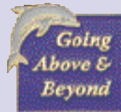
L. Item # PA00079