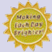
I. Item # PA00080