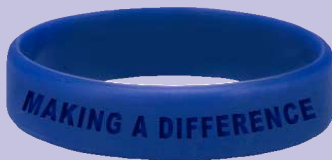
O. Item # PG00036